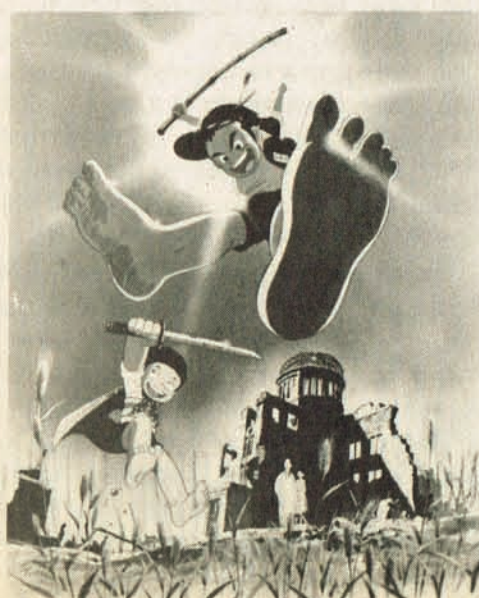
Barefoot Gen Feb 19 - 21

2:30 p.m., 2nd floor BAREFOOT GEN See Feb. 19 for details.