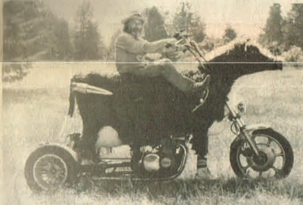
Wild Wheels "Kawasaki"

8:00 p.m., 2nd floor WILD WHEELS a film by HARROD BLANK, 16mm, 64 mins, 1992 $5 general admission/$4 students & seniors/$3 members Harrod Blank follows in the Land of the Owl Turds, where he introduced us into his insane world on wheels, with a feature-length documentary about people like himself, who have transformed their worlds by transforming their cars into works of visual art. Harrod, son of noted documentarian Les Blank, has traveled throughout the United States in his customized VW Beetle (from his home in New Orleans) to assemble an insightful, poetic, and hilarious look at the roots of this communal obsession.