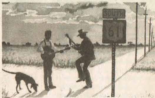
Deep Blues Jan. 23 - 24